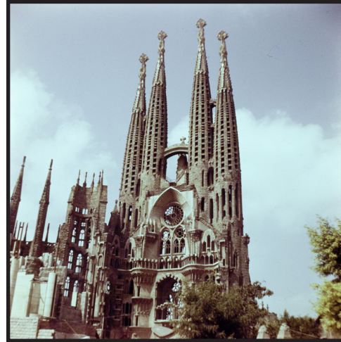
Church of the Holy Family-Barcelona

just a very plain little cabin where a person or people stop to contemplate their beliefs.